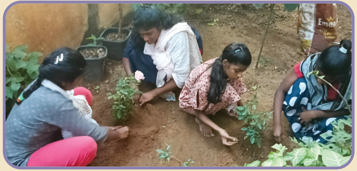
Children plant trees under Swachh Bharat Initiative