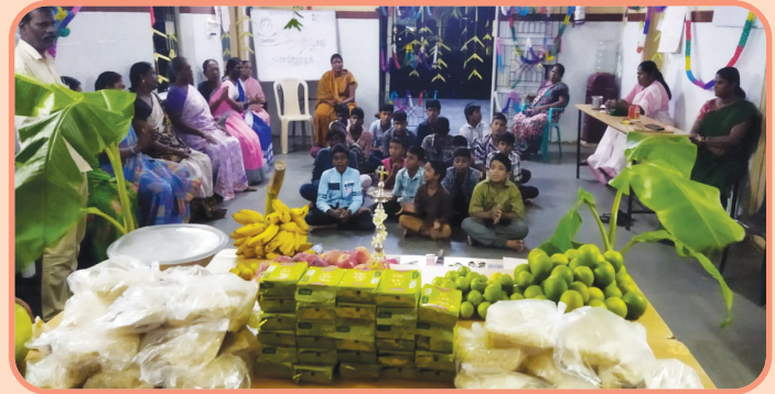
Festival Celebration at our Centre