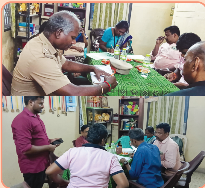
Visit of Government Officials to our Centre

our commitment to upholding excellence in child protection services.