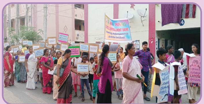
Rally for School Enrolment