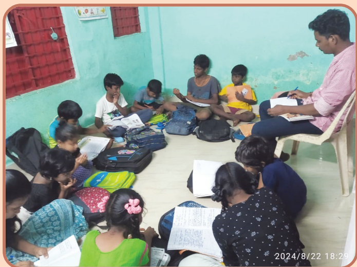
Nurturing academic success

This year, 200 school-going children have benefited from our after-school programmes – achieving remarkable academic improvements and regaining confidence in their abilities. These centres act as learning sanctuaries, guiding children toward brighter futures.