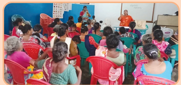
Cancer Awareness Programme