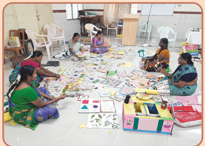
Preschool Teachers' Training

Educators were taught how to design creative teaching aids (charts, puppets, placards), prepare yearly syllabi, and nurture children's readiness for formal schooling. These capacity-building efforts ensure that every teacher becomes a catalyst for transformation in a child's life.