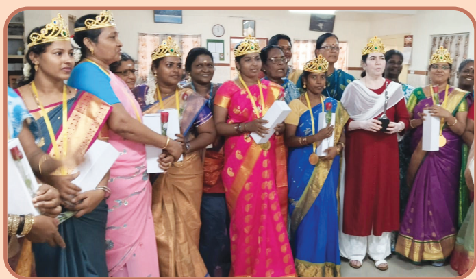
Honouring Preschool Teachers

Teachers' Day is a moment to acknowledge the invaluable contributions of teachers to education and bright society. It is a time to express heartfelt gratitude for their