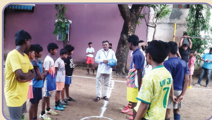
Children's Sports Meet

Sports offer children more than physical strength. They teach discipline, teamwork, and leadership. On Independence Day 2024, we hosted a Football Sports