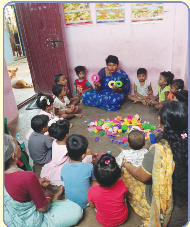
Activities for Preschool children

To complement classroom learning, we conducted targeted skill development sessions with a special focus on motor skills, cognitive abilities, and social-emotional