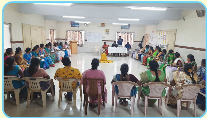
Staff Capacity Building Training

At Asha Nivas, we understand that empowered staff make empowered communities. Our monthly Staff Training Programs are designed to improve life skills, communication, leadership, and technical knowledge, ensuring that each team member works more efficiently, ethically, and effectively.