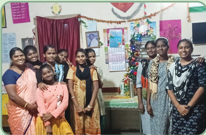
Girls' Open Shelter Home

But beyond services, what truly defines our homes is the love, trust, and personal care that children receive. Every child is treated with dignity, surrounded by adults who listen, understand, and stand by them.