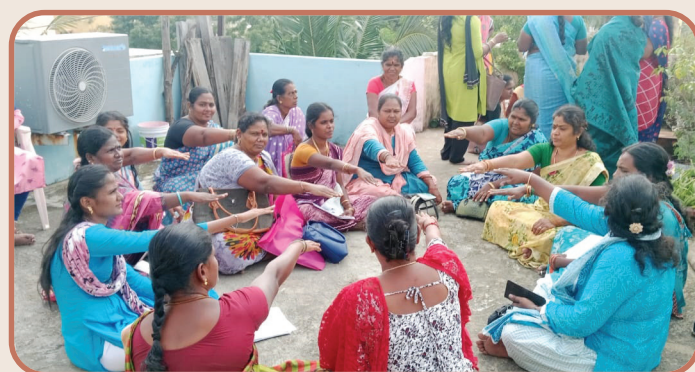
SHG Members at Work