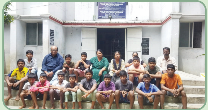
Boys' Open Shelter Home