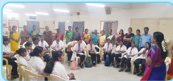
Orientation for College Students