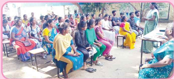
Interaction with Parents of Sponsored Children

Parents are encouraged to support equal opportunities for girls and boys, and many share stories of how their mindsets have shifted through these interactions. Through moral storytelling and open discussions, we nurture a culture where education begins at home.