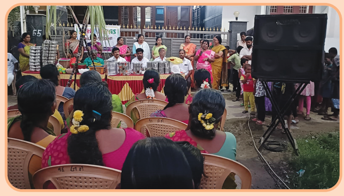
Pongal Celebrations held across various locations