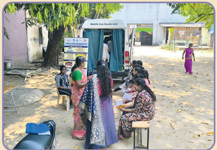
Eye Camp at Our Centre

This initiative ensures that every child sees the world clearly and continues learning without barriers.