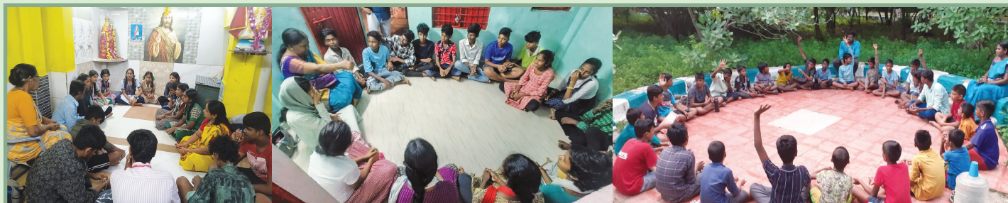
Children at Child Parliament Meetings held across various locations

Each parliament includes ministers with portfolios and meets monthly for leadership training, discussions on local issues, and planning community initiatives. The goal is clear: to raise a generation of informed, responsible, and compassionate change makers.