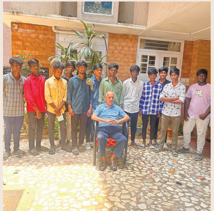
Students interacting with the Director