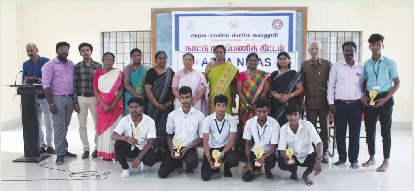
Awareness program on Anti-Drugs Day