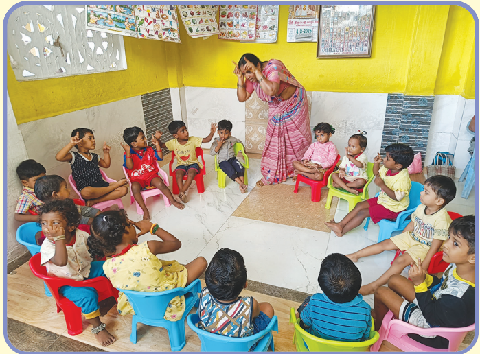
Children at Preschool

These centres do more than teach – they inspire curiosity, instill confidence, and prepare children to successfully transition into mainstream education. With a strong focus on inclusivity and engagement, Asha Nivas works closely