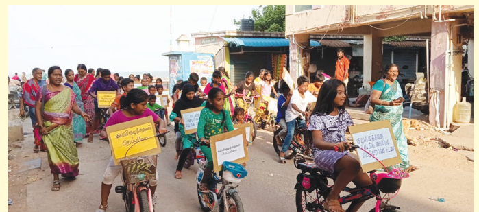
Rally to Prevent School Dropouts

Recognizing that education is key to breaking cycles of poverty, Asha Nivas conducted School Motivation Programmes at Ezhil Nagar and Saidapet on 5th July 2024 and 20th August 2024. Through puppet shows, we creatively emphasized the importance of education, health, and hygiene. The sessions focused on preventing school dropouts and encouraging children to continue their education. More than 400 students participated, with many committing to stay in school and pursue their academic goals with renewed enthusiasm.