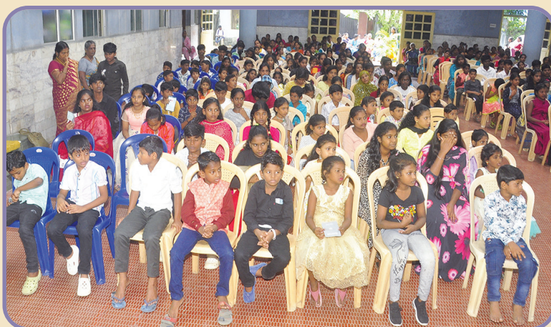
Christmas Celebration with our Children