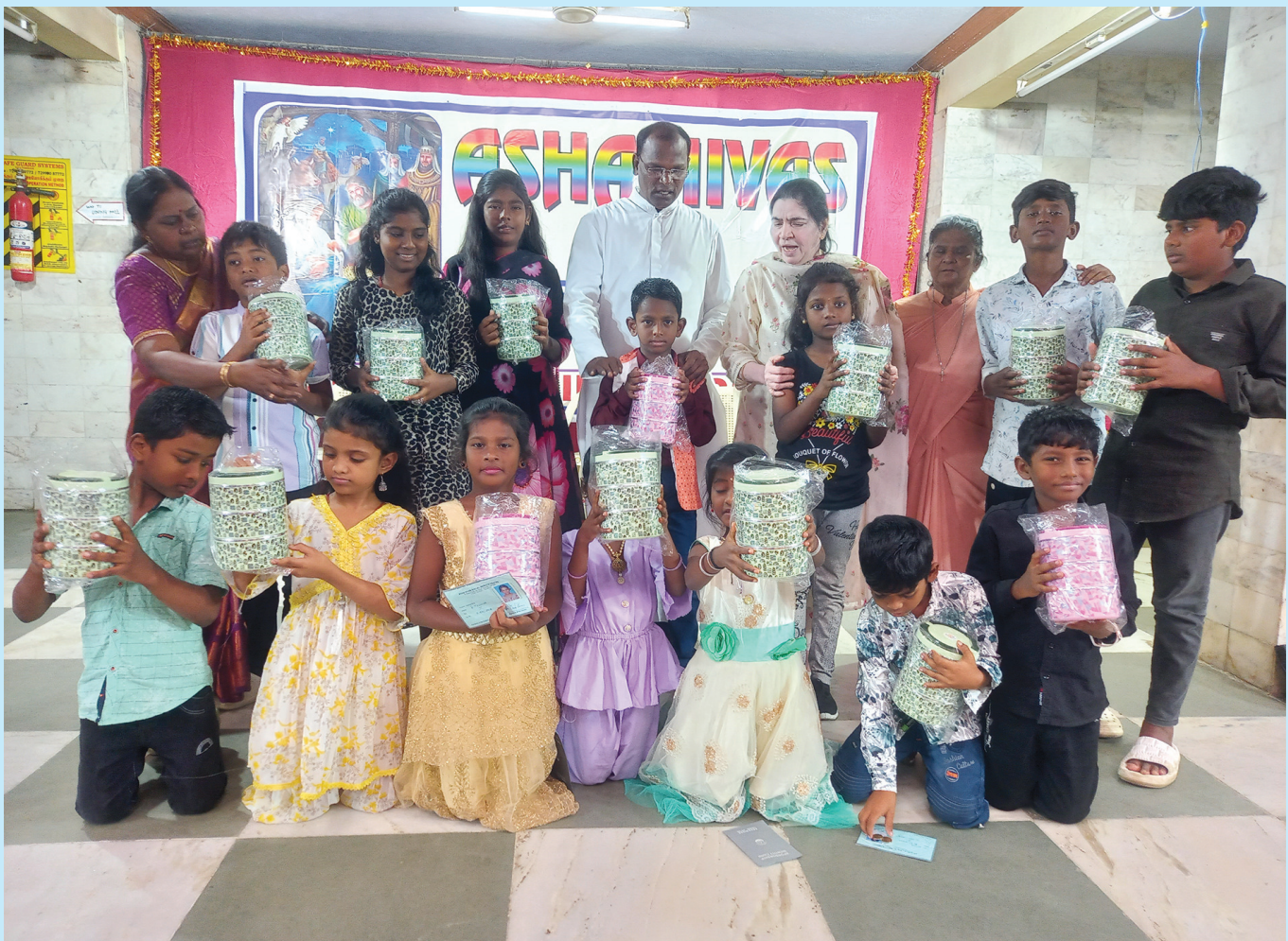
Christmas Celebrations for Sponsored Children

It was a day filled with joy, colour, warmth, and the reaffirmation that every child matters and is worthy of celebration.