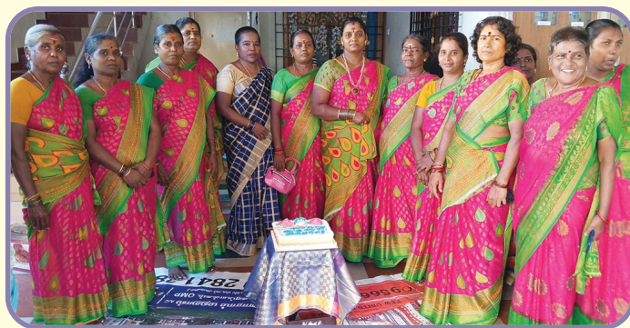
Annual Day Celebrations