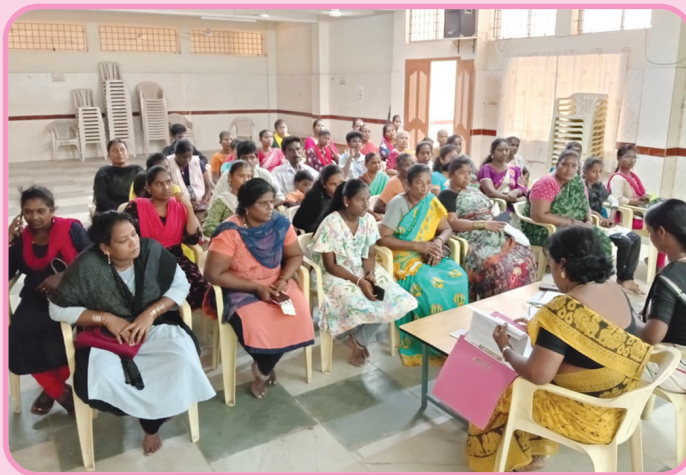
Awareness for Sponsor Parents

These events helped bridge the gap between home and school, ensuring that families become active stakeholders in their children's education.