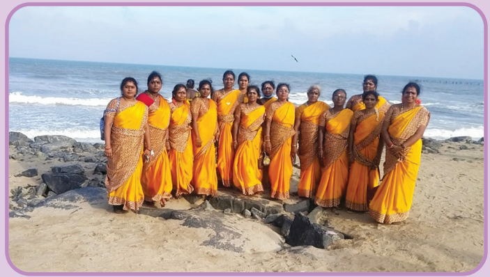
One day Trip by SHG members