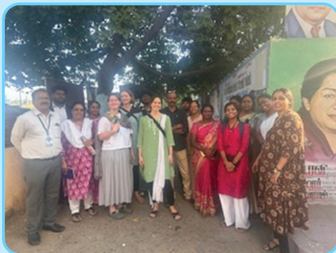
Meeting with ACA members and other partners