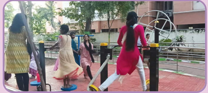
Participation in cultural competitions and recreational activities at the Park