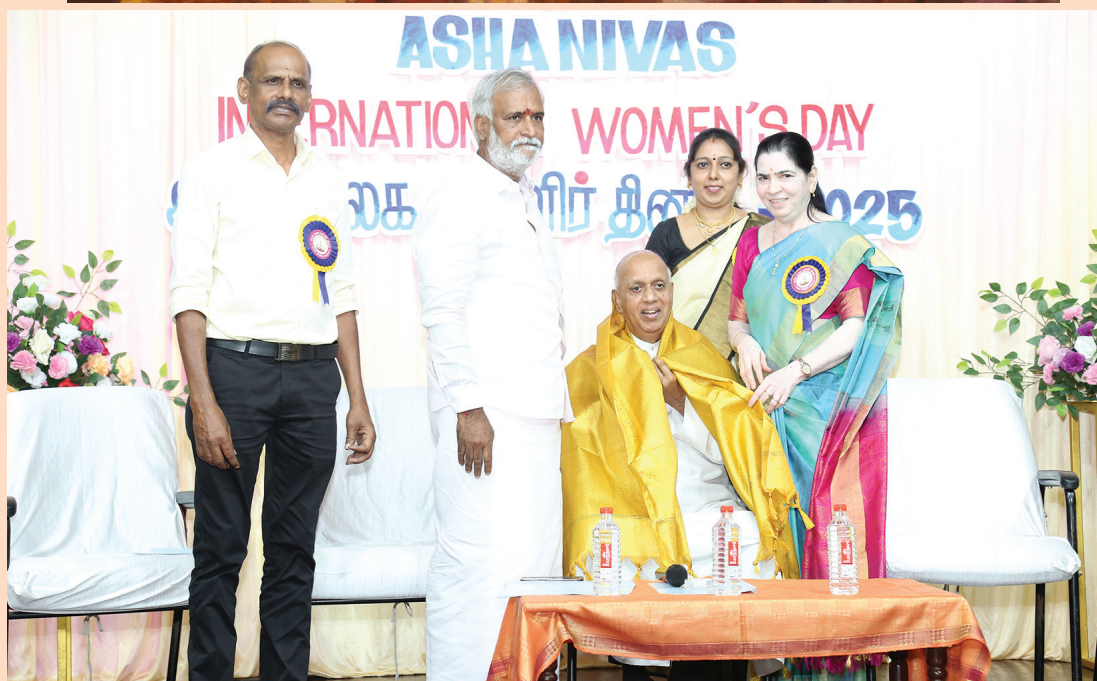
Dignitaries, SHG members, Cultural Programme