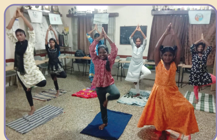
Children Practicing Yoga