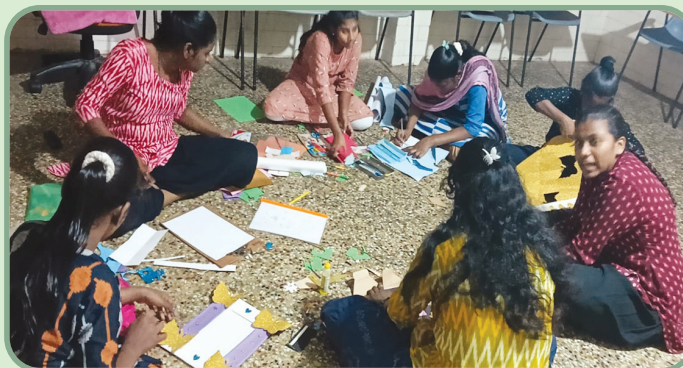
Celebration of International Day of the Girl Child