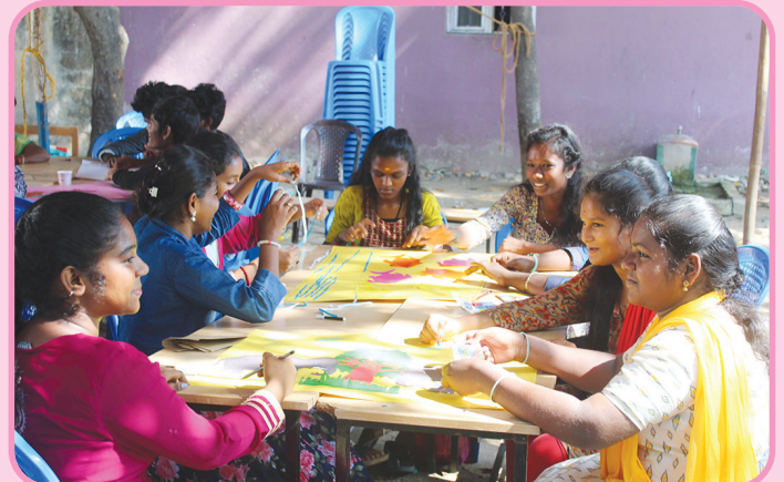
Children at Summer Camp