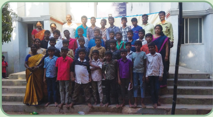
Samarpana Boys' Shelter Home

Referred through the Child Welfare Committee (CWC), each child brought to our shelters is provided with: