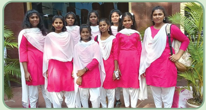
Sanadhana Girls' Shelter Home