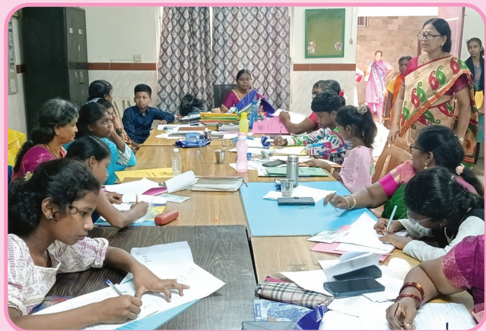
Communicating with the Sponsors

In May 2024, Asha Nivas organized a special letter-writing event for our sponsored children, giving them an opportunity to connect with their sponsors. With great