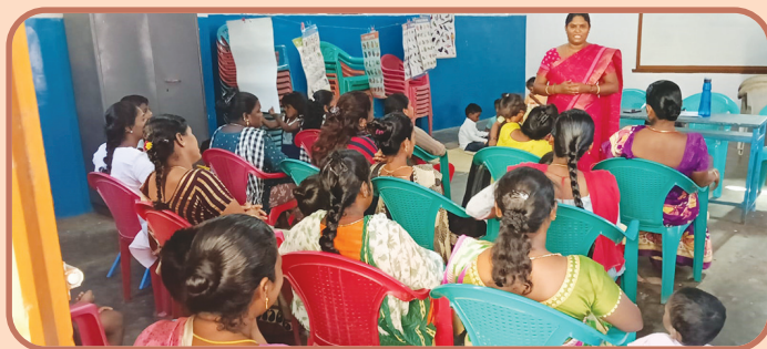
Interaction with Preschool Parents

This year, our meetings served as platforms to celebrate progress, set shared goals, and build a community of support around every child.